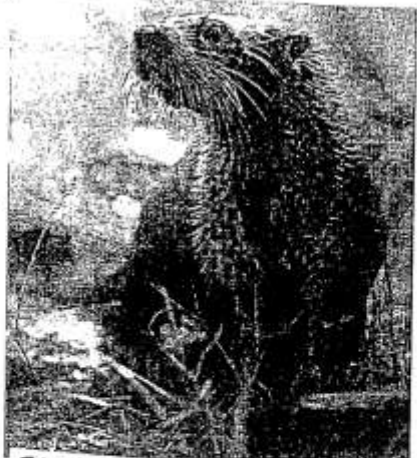
FMLS. C. 1/3 smaller. USUALLY FOUND IN PAIRS OR FAMILIES OF 5 OR 6. THEY DO NOT HIBERNATE. CROSS RDS.