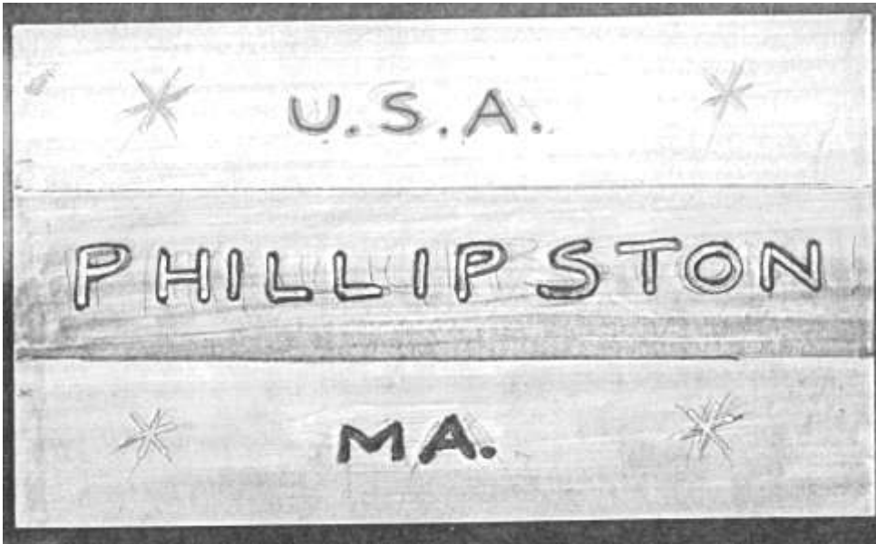
Flag Design With brite colors. 2004 © WM. GRUTERS